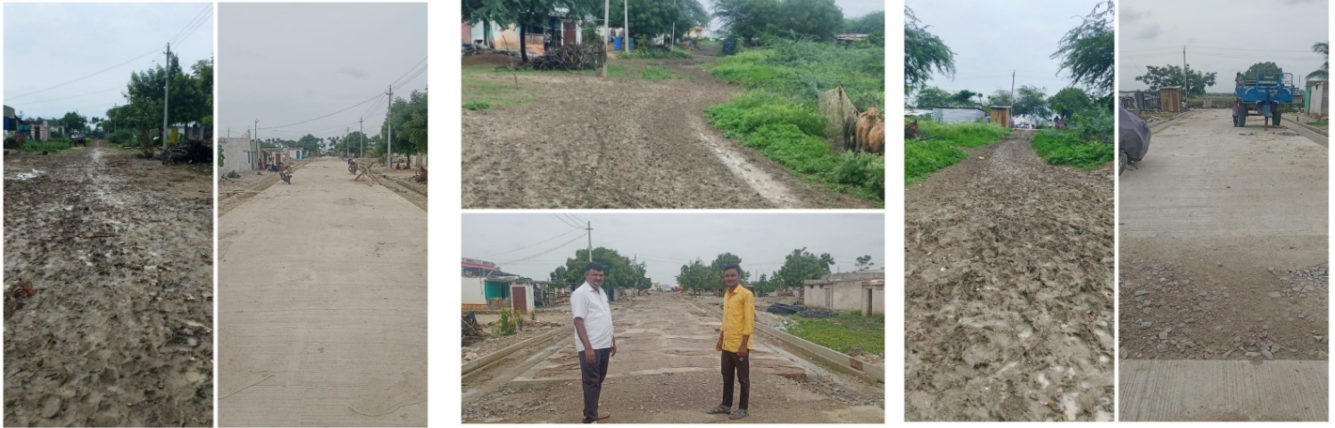
5 lines Road and Drainage Construction – total 780 mts road construction completed through HKRDP Scheme through PWD