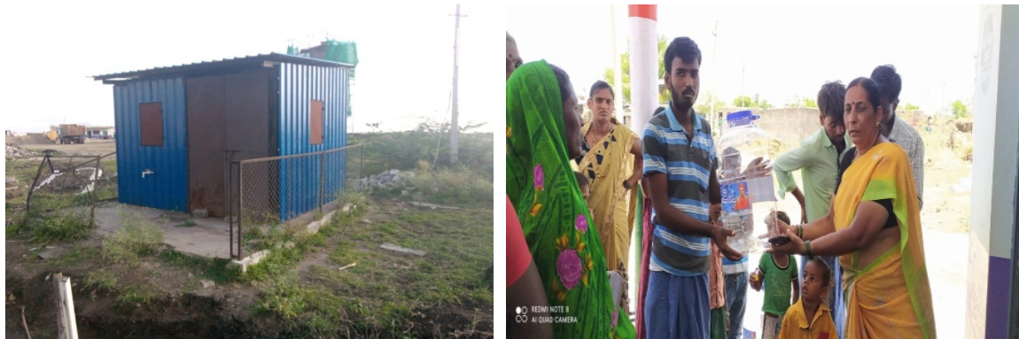
Distribution of Water Cans