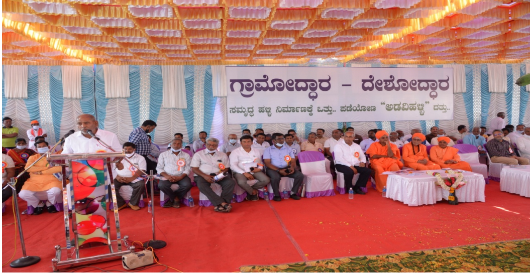
Ground Breaking ceremony at Adavihalli village

Base on the need assessment we planned the activities accordingly. We mainly focused on the following @ Adavihalli